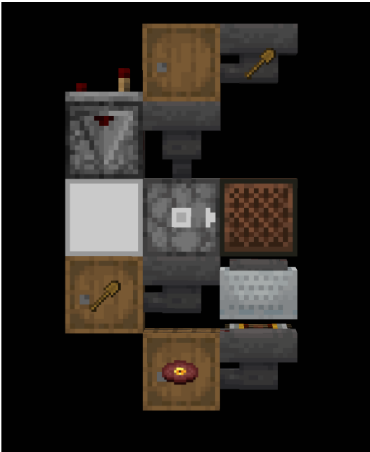
The slightly different setup required for disc sorting.

There is only one block that has blacklisting properties: shulker boxes. These can be sorted by utilizing the fact that any item besides shulker boxes can be placed into a shulker box.