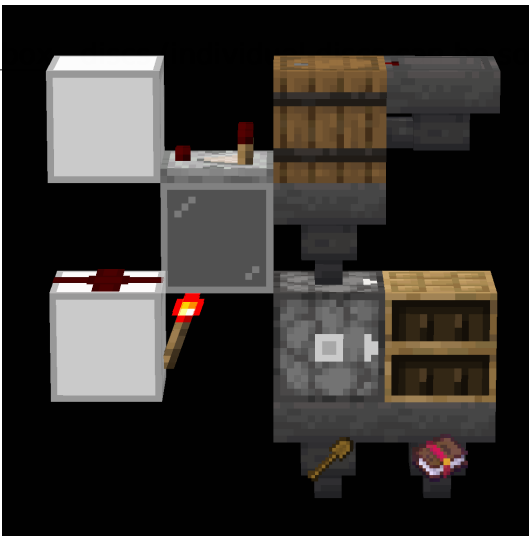
An Enchanted Book sorter using a chiseled bookshelf.

Jukebox - Items that are sorted using their signal strength when played in a jukebox)